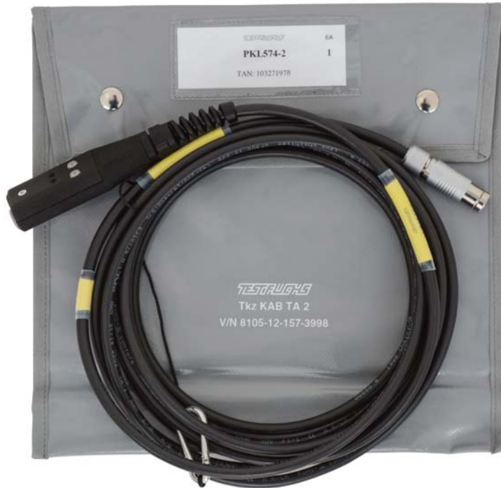
Figure of a similar measuring line

The measuring line is provided for the earth connection test (measuring line B) in combination with measuring line A.