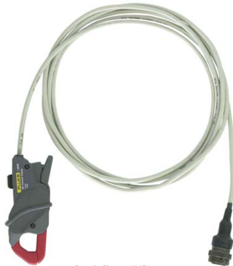
Supply Clamp >IMZ6<