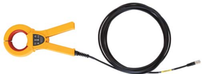
Current Measurement Clamp >SMZ5<