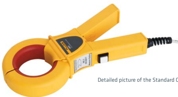
Detailed picture of the Standard Clamp Fluke i800