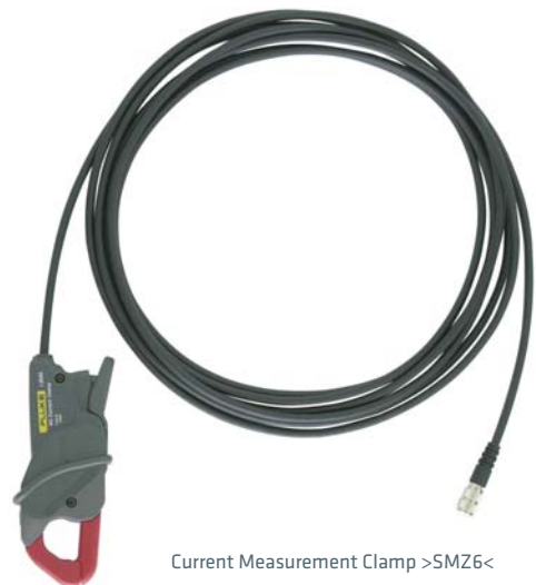
Current Measurement Clamp >SMZ6<