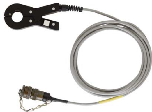
Supply Clamp >IMZ7<