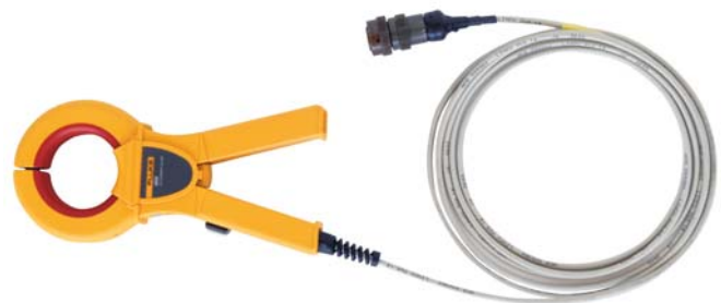
Supply Clamp >IMZ5<