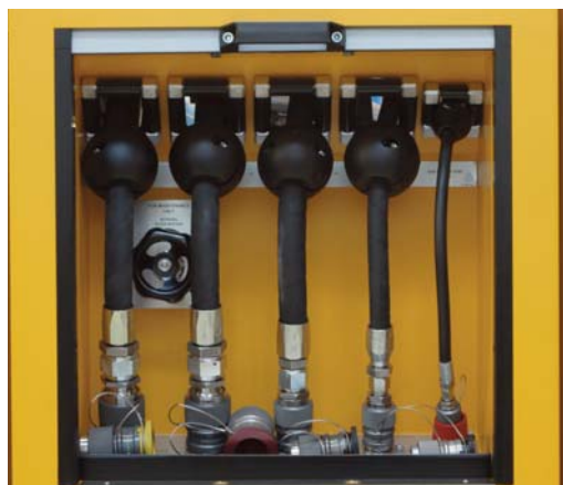
Colour coded test connections