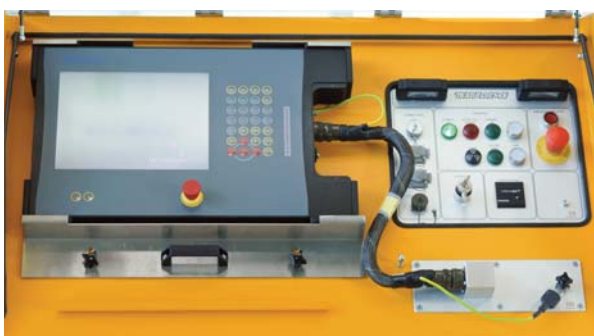
Touch panel and operating elements