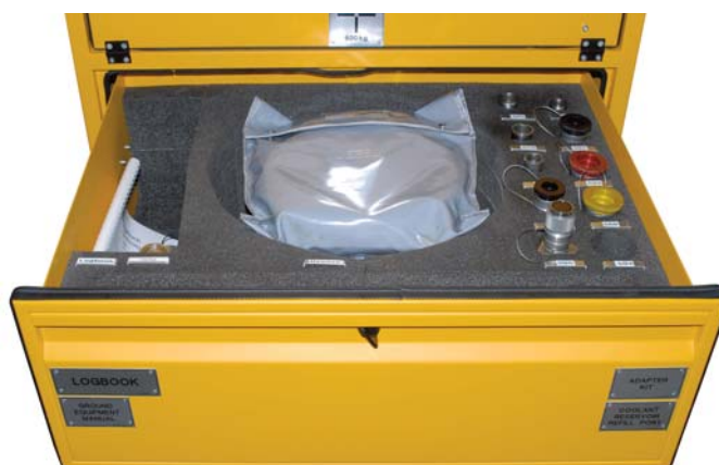
Type of aircraft specific adapter