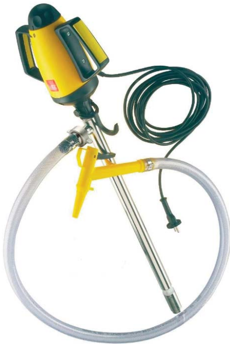
drum pump (symbolic figure)