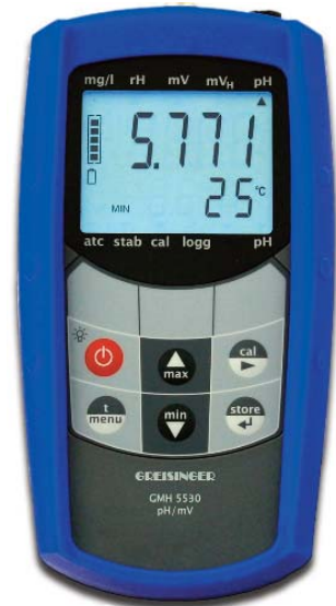
PH-meter (symbolic figure)