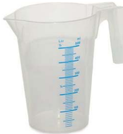
sampling glass (symbolic figure)