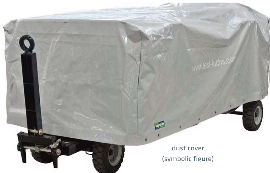
dust cover (symbolic figure)